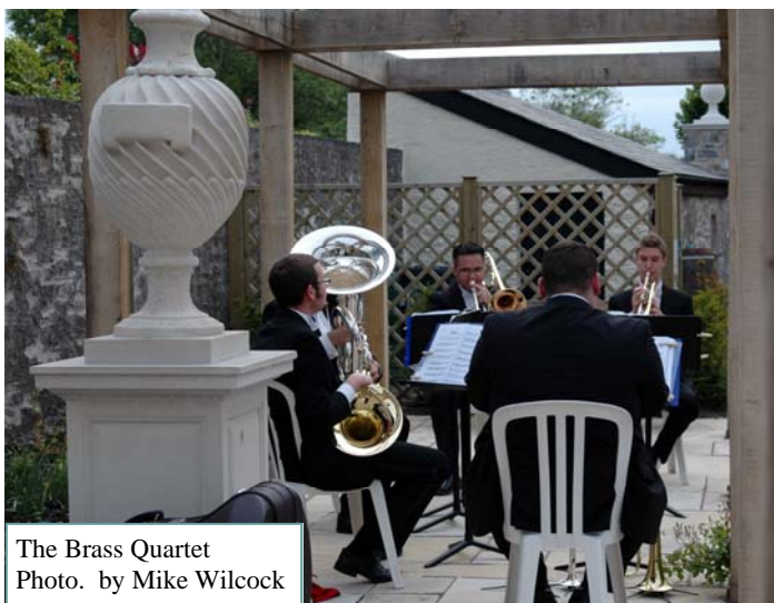
The Brass Quartet

Highlight of the weekend was the Saturday evening members' garden party, an event that drew some 160 people, including almost 40 guests. Thankfully the rain held off, providing the opportunity for people to take a leisurely stroll to examine the planted beds and the numerous furnishings while a quartet of brass